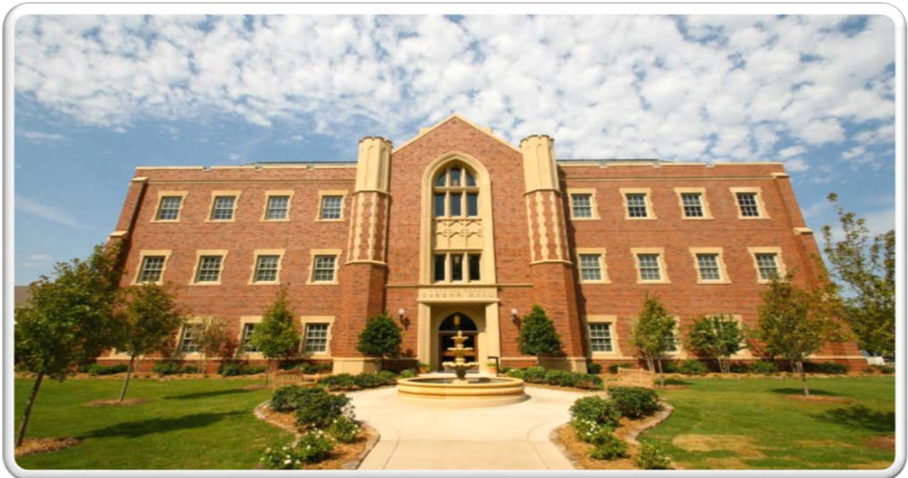
Anne and Henry Zarrow Hall- Norman, Oklahoma